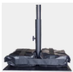
Base Plate & Sandbag