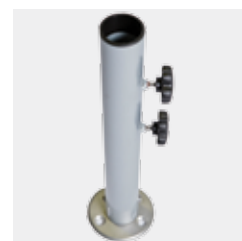
Cam-Lock Plate & Spigot