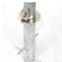
In-ground Socket & Sleeve kit