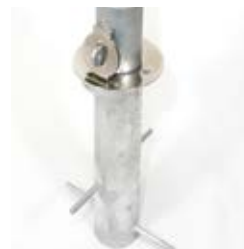
IN-GROUND SOCKET & SLEEVE KIT