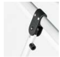
HIGH IMPACT RESIN JOINTS