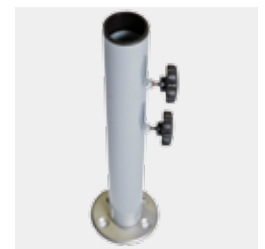
CAM-LOCK PLATE & SPIGOT